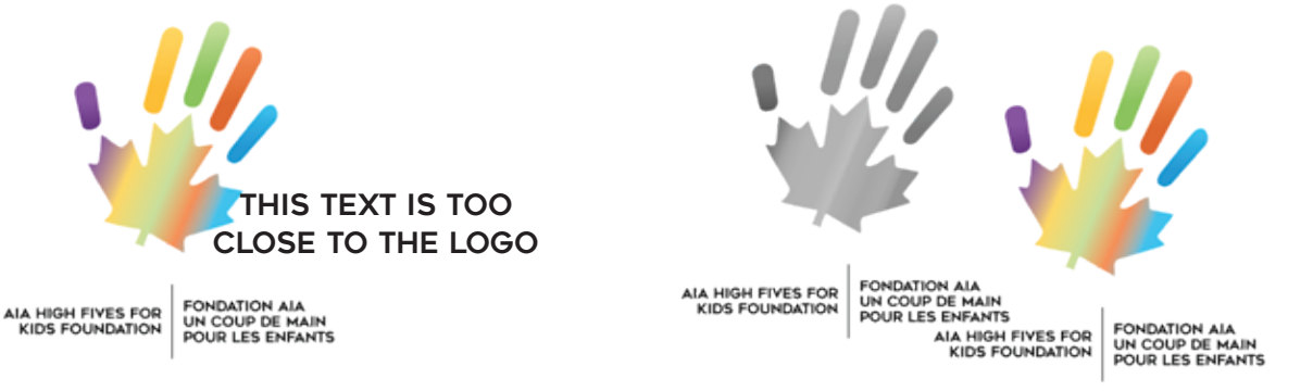
THESE LOGOS ARE TOO CLOSE TOGETHER

Don't overcrowd the logo. Ensure that there is enough "white space" around the logo to allow clear identification of our brand, this goes for text, images and other company logos.